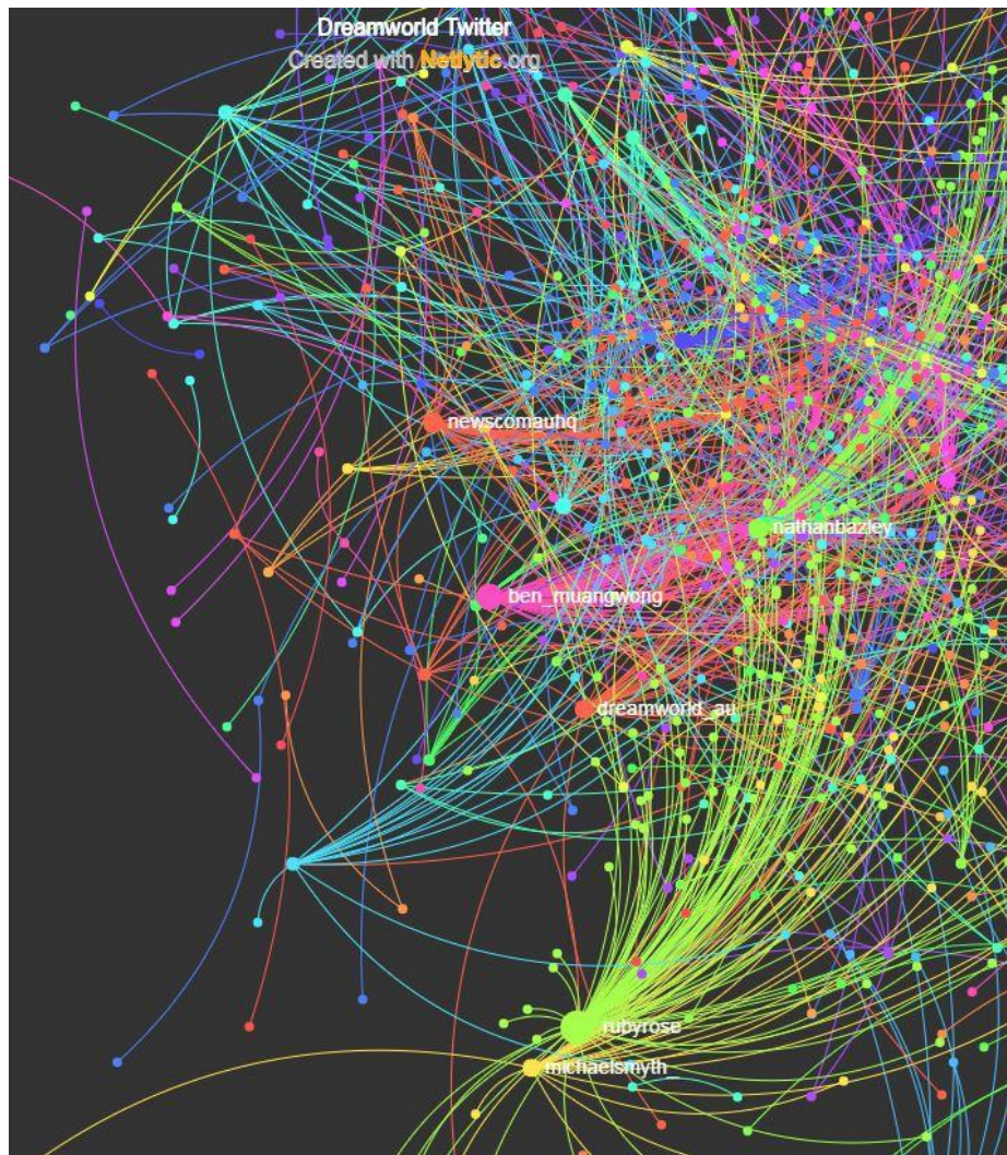
Figure 2: Social network diagram from #dreamworld

From Figure 2, one can identify the strength of ties between individuals based on the number of lines joining one user to another. This diagram is of use to tourism practitioners as they could focus their efforts on addressing the main players in the network, and in doing so, ensure that the systemic crisis response permeates a wider audience, as recommended by Austin, Liu and Jin (2012).